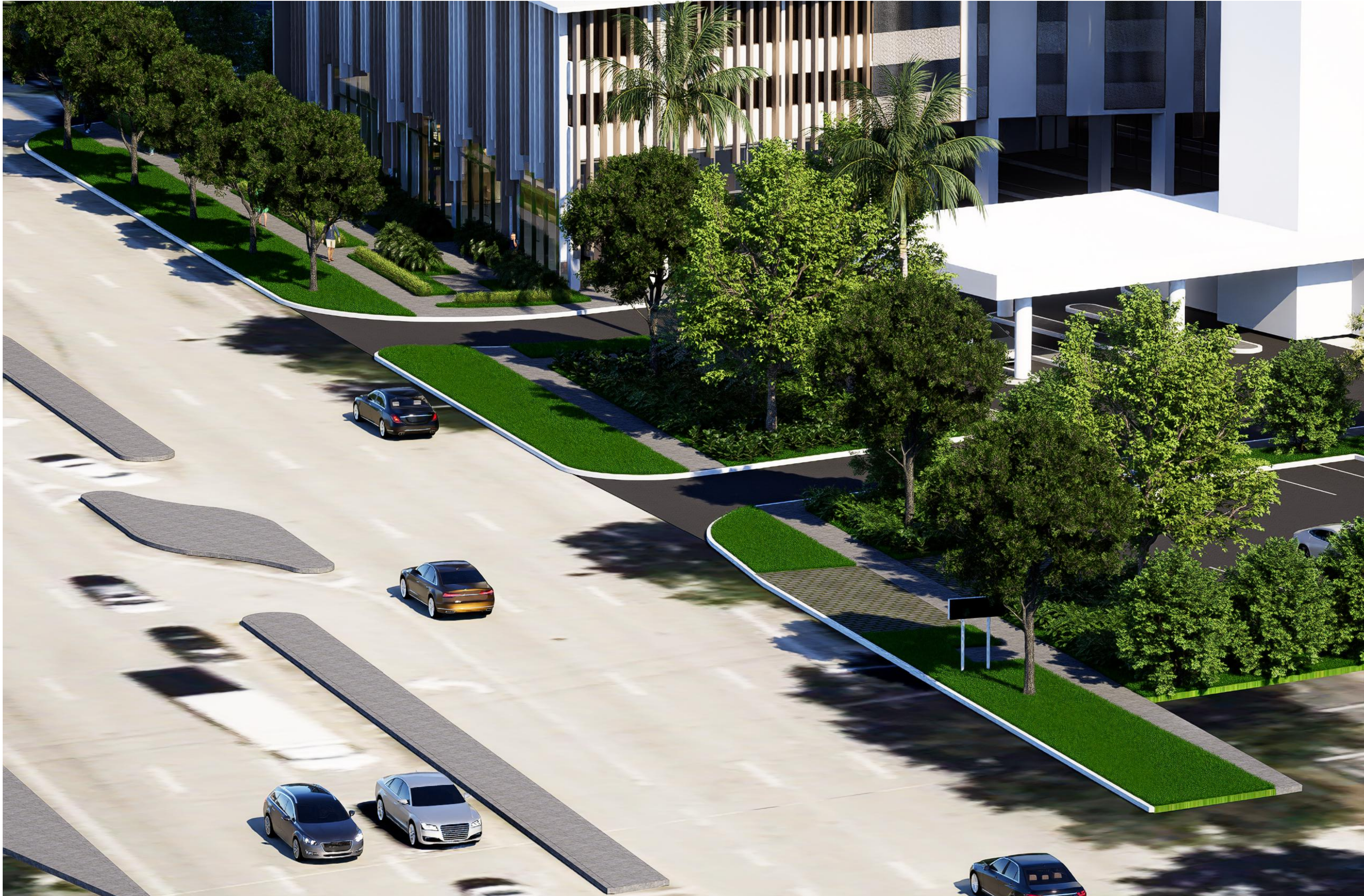
FIRE TRUCK ENTRANCE ON FEDERAL HIGHWAY